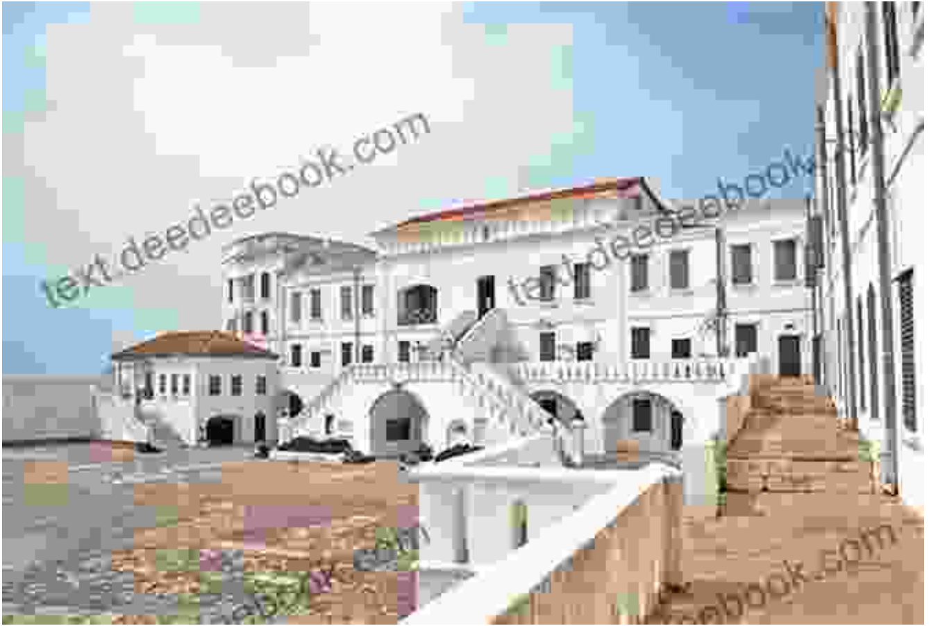
The Cape Coast Castle in Cape Coast, Ghana.