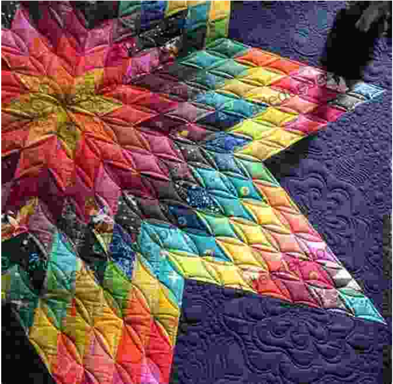
A pint-size quilt adorned with intricate star blocks, evoking the elegance and authenticity of antique quilts.