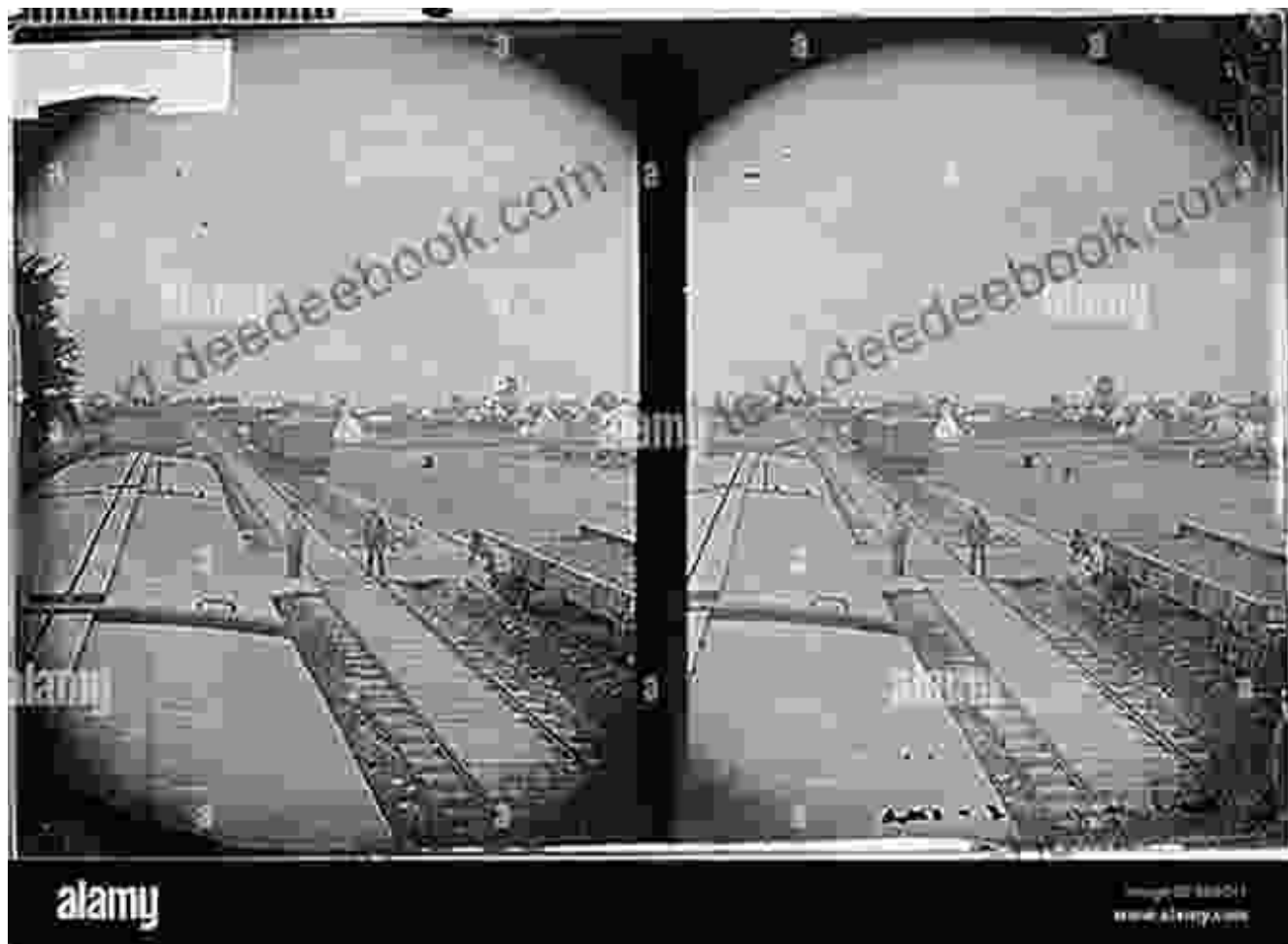
The Central Pacific Railroad, by Mathew Brady

One of Brady's most famous photographs of railroads is his image of the Central Pacific Railroad. The photograph shows a train traveling through the mountains of California. The photograph is a beautiful and iconic image of the American railroad system.