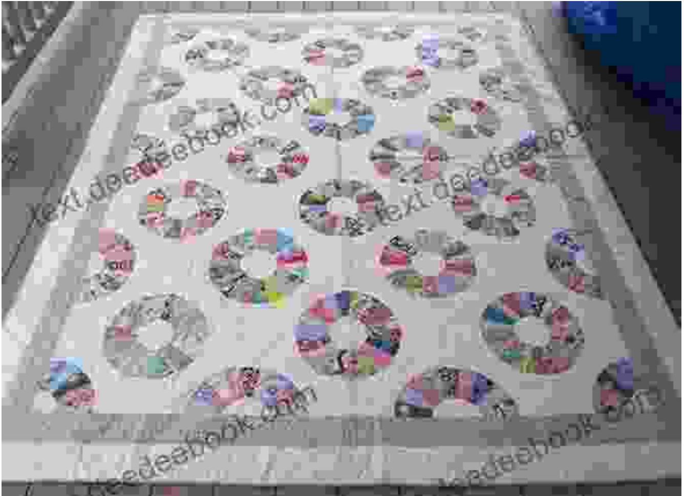
Dresden Plate Friendship Quilt by Pat Sloan

This elegant quilt is made from 12-inch Dresden plate blocks that are sewn together in a variety of arrangements. The blocks are made from a variety of fabrics, including solids, prints, and batiks. The quilt is finished with a simple border.